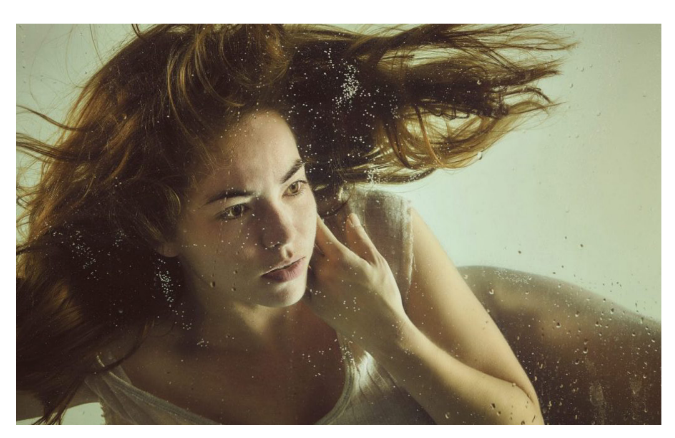
34 Mentor report, 2018.

The actions that Projecte Ingenu took through the Creative Lenses project suggest that business model change enables the organisation to think holistically about its context and future and develop new capacities for change: 'Small things are happening, just because we talked about them.' This strategic, future-oriented thinking allowed the group to explore and articulate how they would like to grow and develop as an organisation, resulting in increased capacity to grapple with the uncertainties of the environment they are in.